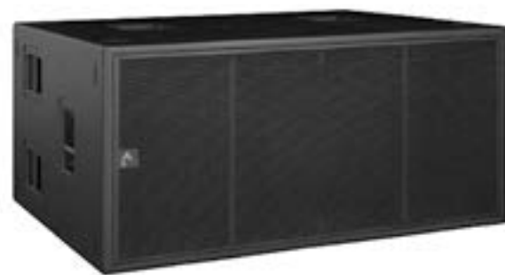
Axiom Pro Audio SW218XA

Amplification: 4,000 watts Response: 36 Hz to 100 Hz (±3 dB) Dimensions: 23.3 x 48 x 37.5" (HxWxD) Weight: 267 pounds Flyable: No Pole Mount: Yes Notes: Onboard CORE DSP with remote access to parameters