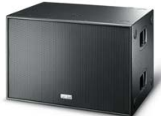
FBT SUBline 218Sa

Amplification: 1,200 watts RMS Response: 30 Hz to 120 Hz (-6 dB) Dimensions: 31 x 45 x 31.5" (HxWxD) Weight: 179 pounds Flyable: No Pole Mount: Yes Notes: Onboard DSP