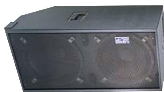
Bag End PD18E-R Infrasub

Amplification: 1,340 watts continuous Response: 60 Hz to 250 Hz (±3dB) Dimensions: 23 x 43.5 x 18" (HxWxD) Weight: 148 pounds Flyable: No Pole Mount: Yes Notes: Optional Infra Integrator expands response to 8 Hz (±3dB)