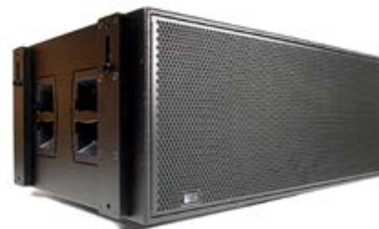
Meyer Sound 1100LFC

Amplification: Class-AB/H two channels (bridged) Response: 30 Hz to 85 Hz (±4 dB) Dimensions: 20.5 x 52.6 x 33" (HxWxD) Weight: 249 pounds Flyable: Optional rigging kit Pole Mount: No Notes: RMS module can connect 1100-LFC to RMS network for real-time monitoring