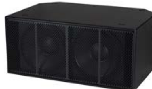
Fulcrum Acoustic Sub218Lac

Amplification: (2) 1,600 watt Response: 24 Hz to 152 Hz (-10 dB) Dimensions: 20.6 x 45 x 30" (HxWxD) Weight: 167 pounds Flyable: Yes Pole Mount: No Notes: Networkable; Powersoft-designed amps and DSP