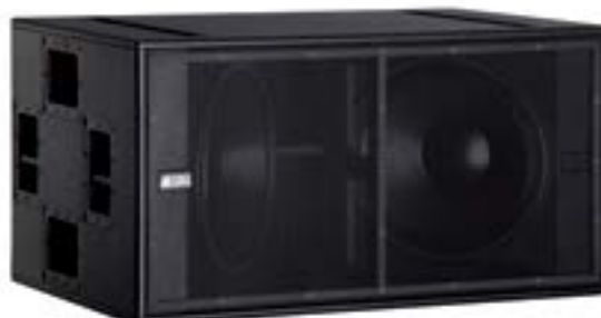
dB Technologies DVA S30N

Amplification: 3,000 watts Response: 30 Hz to 120 Hz (-3 dB) Dimensions: 23.2 x 44 x 28.8" (HxWxD) Weight: 183 pounds Flyable: No Pole Mount: Yes Notes: Onboard DSP control; networkable