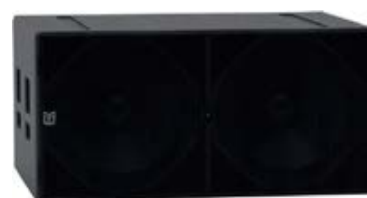
Martin Audio CSX-LIVE 218

Amplification: 2,000 watts continuous Response: 35 Hz to 150 Hz (±3 dB) Dimensions: 21 x 43 x 31" (HxWxD) Weight: 231 pounds Flyable: Yes Pole Mount: No Notes: Onboard DSP and Dante Networking