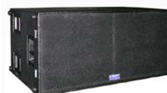
ISP Pro Audio XMAX 218

Amplification: 2,000 watts RMS Response: 35 Hz to 100 Hz (-3dB) Dimensions: 22.5 x 48 x 30" (HxWxD) Weight: 230 pounds Flyable: No Pole Mount: No Notes: D-CAT high-current amplification