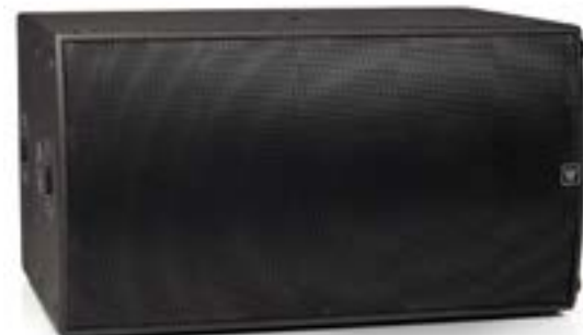
Carvin Audio TRx2218A

Amplification: 2,500 watts Response: 38 Hz to 1.5k Hz (-3dB) Dimensions: 23 x 40 x 29" (HxWxD) Weight: 139 pounds Flyable: No Pole Mount: Yes Notes: Onboard X-Drive DSP