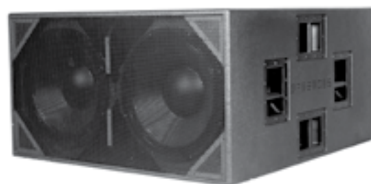
BassBoss ZV28 Profundo

Amplification: 4,000 watts RMS continuous Response: 25 Hz to 90 Hz (-3 dB) Dimensions: 23 x 42 x 42" (HxWxD) Weight: 220 pounds Flyable: Yes Pole Mount: Yes Notes: Comprehensive integrated DSP