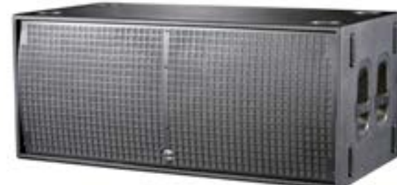
DAS Aero Series 2 LX-218CA

Amplification: 2,400 watts Response: 28 Hz to 100 Hz (-10 dB) Dimensions: 22 x 51 x 25" (HxWxD) Weight: 177 pounds Flyable: Optional Pole Mount: No Notes: DASnet-version and unpowered also available.