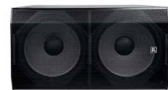
OmniSistem Beta 3 TW218Ba

Amplification: 4,500 watts RMS Response: 35 Hz to 200 Hz (-3dB) Dimensions: 22.3 x 42.3 x 31" (HxWxD) Weight: 187 pounds Flyable: No Pole Mount: No Notes: Master volume, high cut, phase select controls