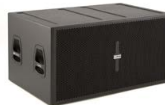
Lynx Pro Audio LX-218S

Amplification: 3,600W Class-D Response: 35 Hz to 125 Hz (-3 dB) Dimensions: 21 x 42.5 x 27.5" (HxWxD) Weight: 158 pounds Flyable: No Pole Mount: Yes Notes: USB port for onboard DSP; optional networking